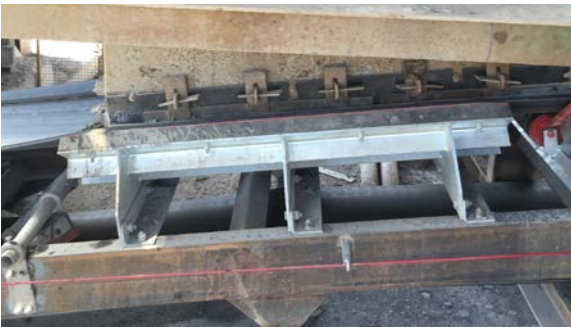
ABOVE Image of Transfer point AFTER Conveyor Upgrade

This was understood to be a combined result of the conveyor belt sag not allowing material to get up under the skirting, causing a pinch point and the polyurethane skirting tip, being an abrasion resistant material.