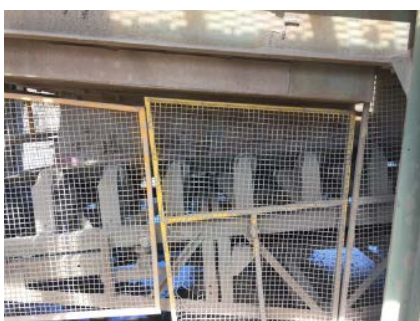
ABOVE Image of Transfer point BEFORE Conveyor Upgrade

With the vertical impact drop height from the cone crusher being 2.5m and a lump size of minus 60mm provided evidence that the material was pooling, due to the material not moving in the direction of the conveyor belt. A combination of conveyor belt sag and inconsistent conveyor idler profile resulted in an ineffective skirting system, therefore resulting in the dust emissions and spillage.